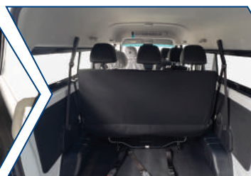
Rear Boot Space